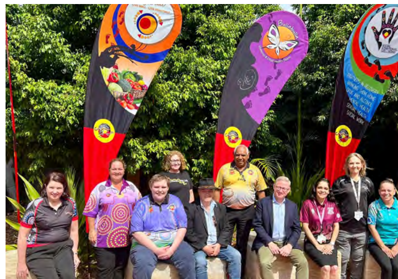
The announcement of Literacy for Life Foundation's funding boost at Tharawal Aboriginal Corporation.

Are you an ALA member with news to share? Email us at info@ala.asn.au