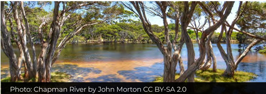
Photo: Chapman River

In NT , the Territory Labor Government has announced the $92 million Skilling the Territory Investment plan 2022–23, which includes funding for pre-employment and equity training programs for disadvantaged Territorians. nationaltribune.com.au/suite-of-grants-to-upskill-territory-s-workforce-in-2023