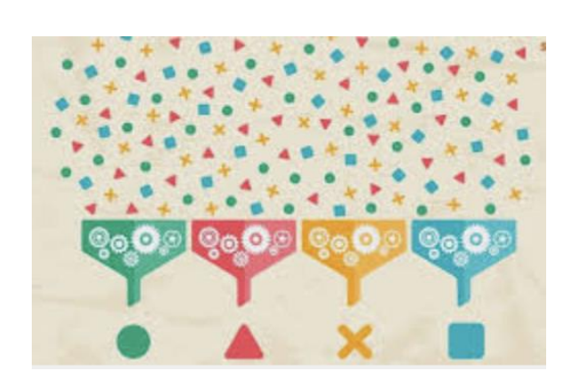
Categorising or Sorting?