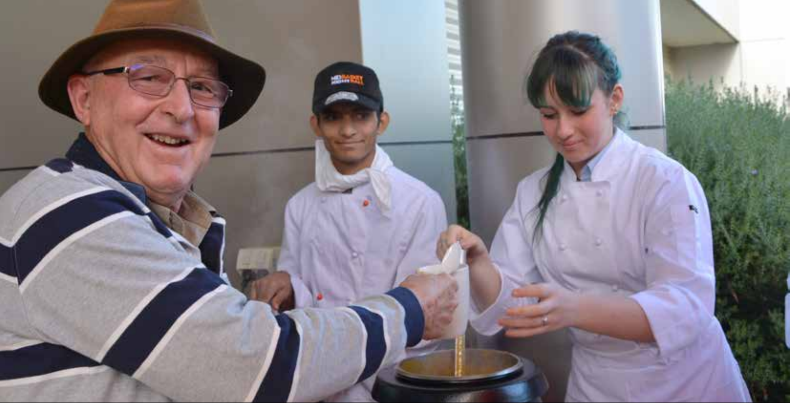
Albury High School students serving a healthy lunch.

around for the health information they needed. We had 80 people along which given it was the school holidays was a pretty good turnout.