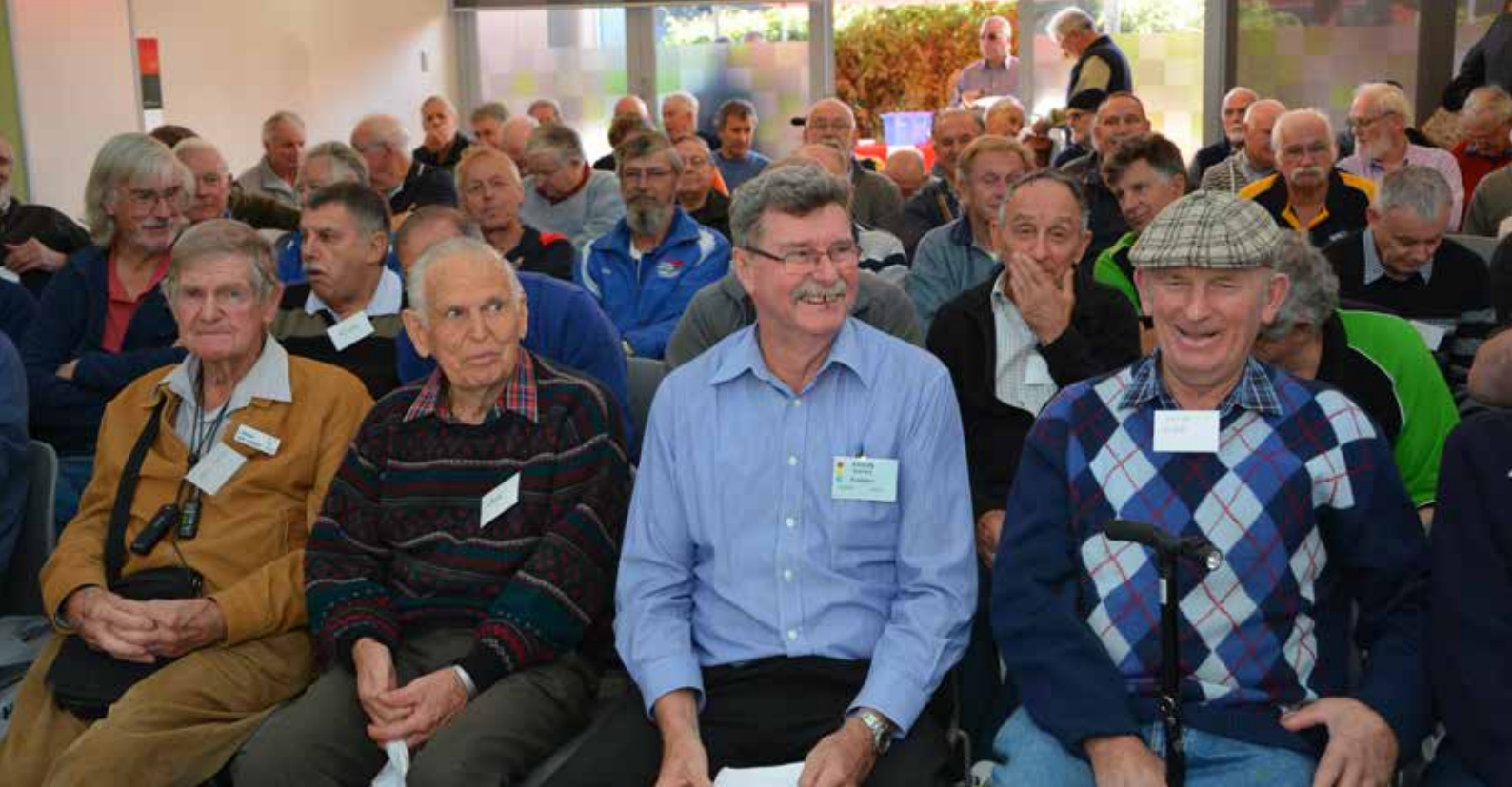
100 men attended the event organised by Albury North Men's Shed.